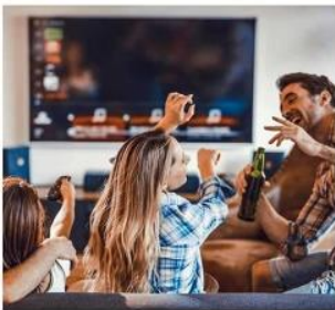
▲ Home Theater