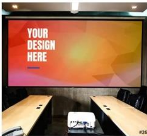
▲ Family Picture Share