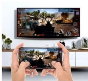
▲ Play Games